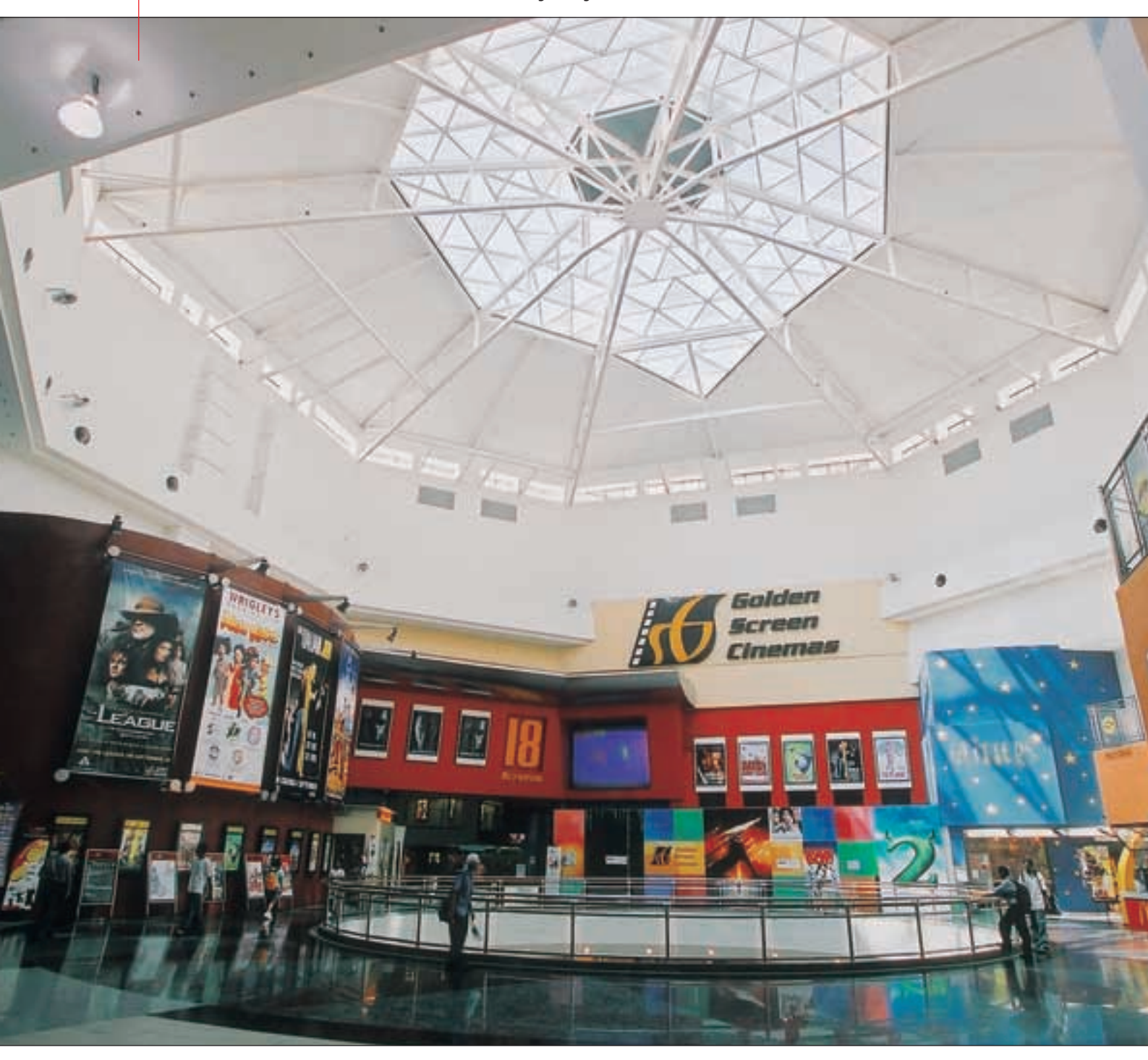
L\hbox{eisure \& Entertainment at Mid Valley City}