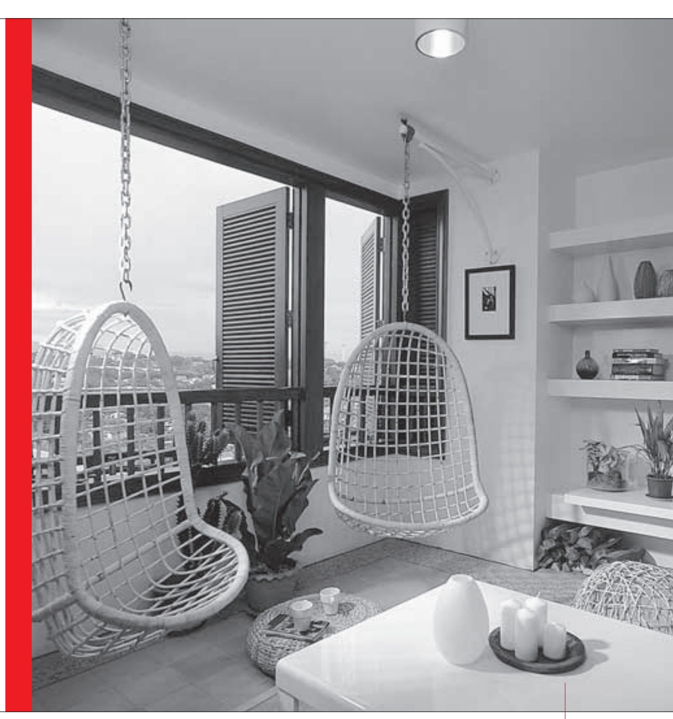
Desa Damansara 2