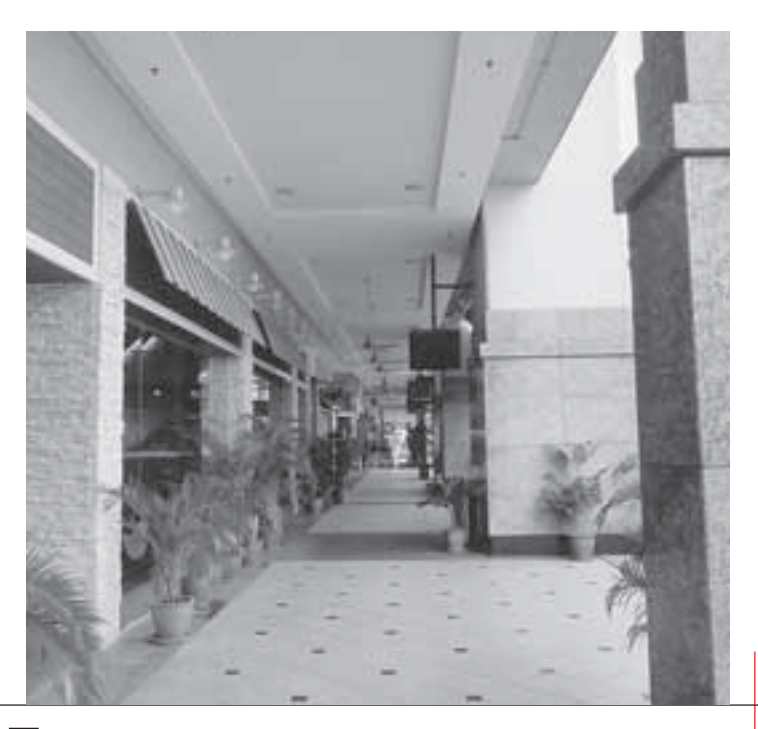
The Boulevard, Mid Valley Megamall

The system of internal control was satisfactory and has not resulted in any material losses, contingencies or uncertainties that would require disclosure in the Group's annual report.