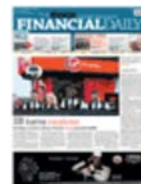
The Edge Financial Daily