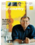
City & Country