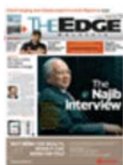
The Edge Malaysia