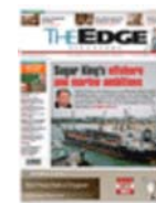
The Edge Singapore