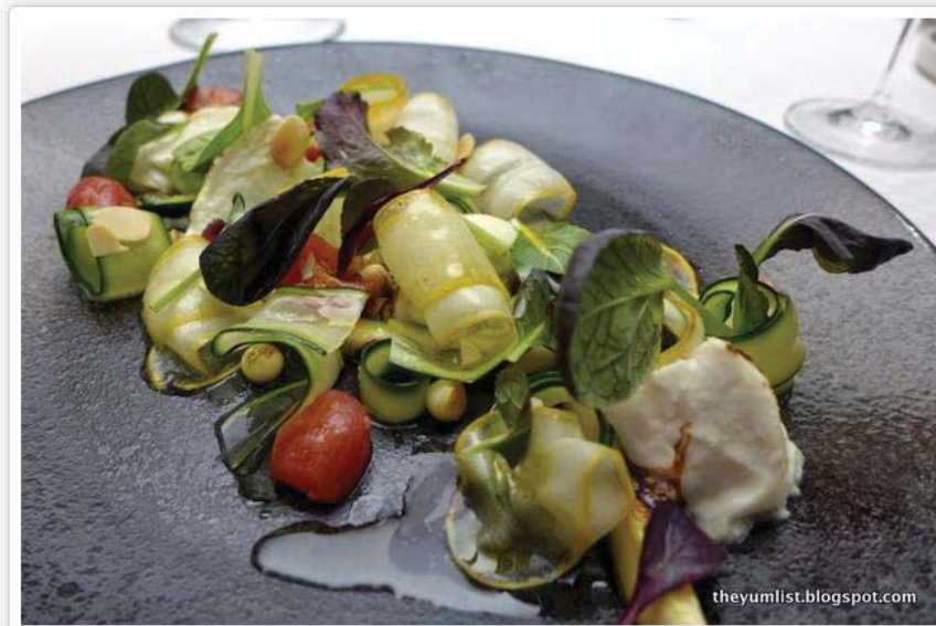
Mozzarella Zucchini Salad

A sharing plate comes out first with Italian buffalo mozzarella balls, raw and cooked green and yellow zucchini shavings, and cherry tomatoes, deliciously dressed with pesto, balsamic and a honey lemon dressing. Flaked almonds contribute a crunch, and mixed greens a garden freshness. It's both a satisfying and fresh beginning.