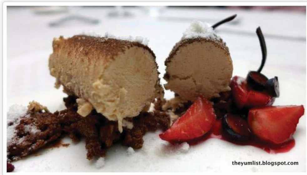
Frozen Hazelnut Parfait

The climax, Frozen Hazelnut Parfait, is crested with white chocolate powder snow, and based with crispy chocolate biscuit crumble and soil. A strawberry compote and gel makes a lovely contrast in colour, and in flavour too, providing a sweet closing zing, and breaking up the creamy parfait.