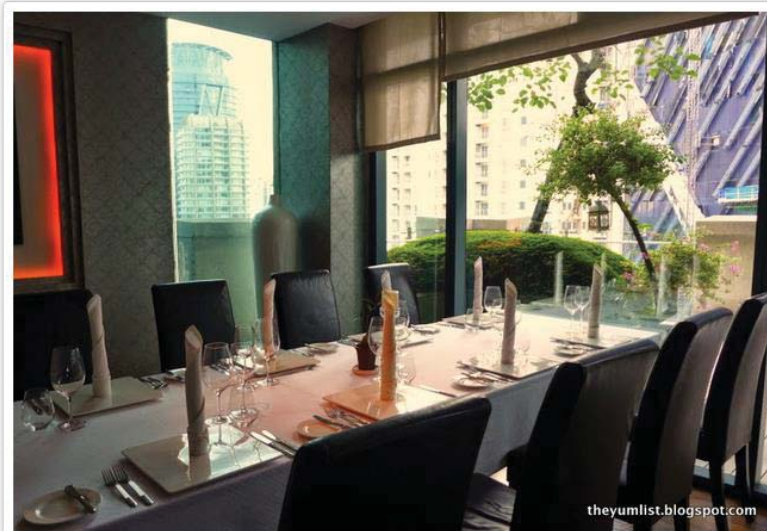
Private Dining Room