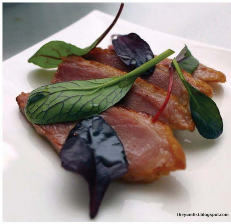
House Smoked Duck

"Something very simple using mostly local produce," announces chef with the dispensing of the next plate. Sakura chicken is marinated with lemon grass, kaffir lime juice, garlic, and coconut milk, then prepared sous vide to retain the flavours. Finally it's grilled, giving a golden tone to the edges, but maintaining moisture within. Sweet potato, baby carrots, French beans and spinach prove toothsome sides. Chicken jus with sherry vinegar and dill oil encircle the plate, wrapping it all into one delicious parcel.