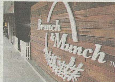
Egg-cellence in a shell