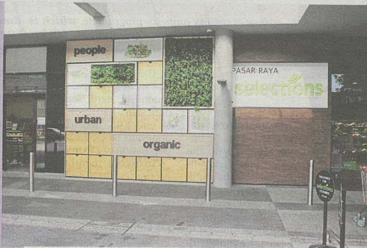
The entrance on street level.

□ Story courtesy of Henry Butcher Malaysia