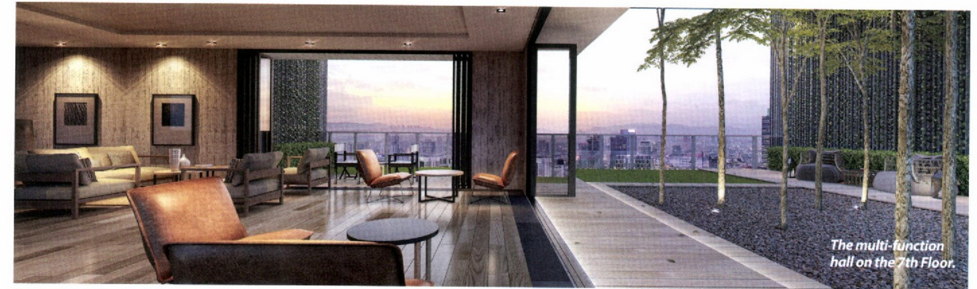
The multi-function hall on the 7th Floor.

The kitchens are fully fitted with quartz stone countertop and French appliances by De Dietrich and Brandt